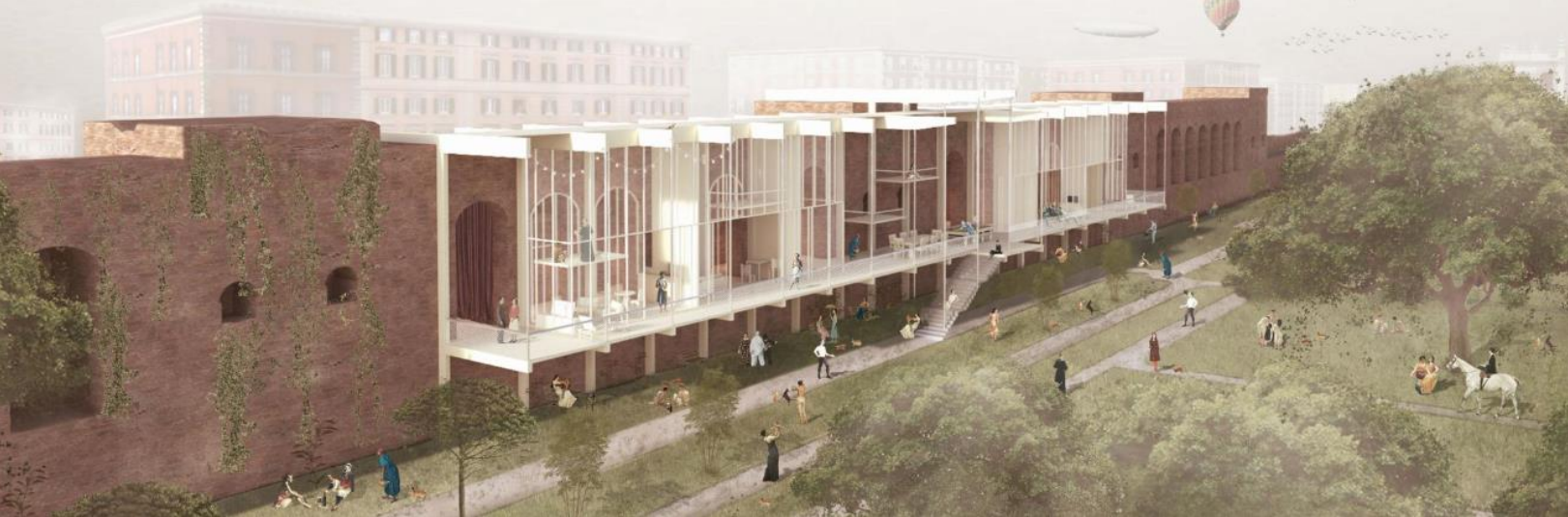
Exterior perspective of intervention at Porta S. Giovanni

Architecture competition Rome Collective Living Challenge 1st prize winners and Student prize winners - Lund University