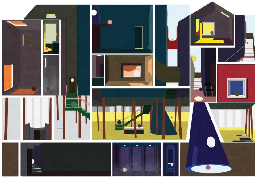
collage illustrating different spaces with exclusive qualities and the gradient of the spaces