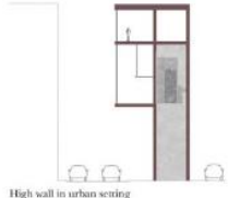
High wall in urban setting

As the physicality and context of the wall changes, it provides different qualities generating a variety of interventions. This project goes into detail in one of the many possible sites, located near the gate of Saint Giovanni.